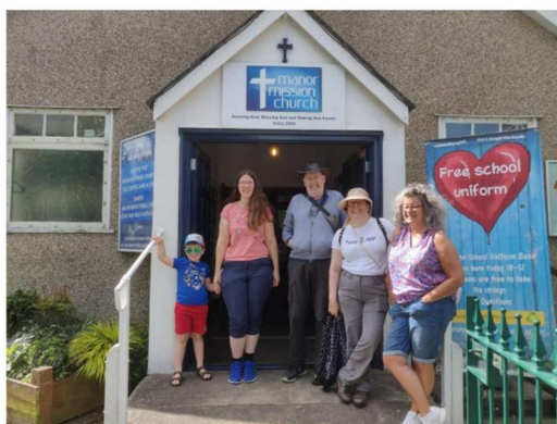
Minor Vision Church