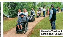
Hamein Trust took part in the Fun Walk