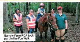
Barrow Farm RDA took part in the Fun Walk

For more and to view more photos, visit thefunwalktrust.co.uk .