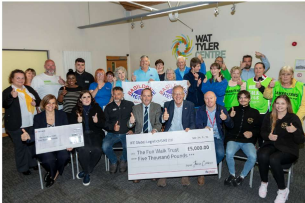
John Baron MP with Deputy Lieutenant of Essex and Fun Walk Sponsors and Charities

The Fun Walk organisers held a publicity event at Wat Tyler Park on Friday to raise awareness of the Platinum Jubilee Fun Walk which runs through June. Charities and local community group are encouraged to register and complete a sponsored walk and benefit from the Fun Walk Bonus Pot.