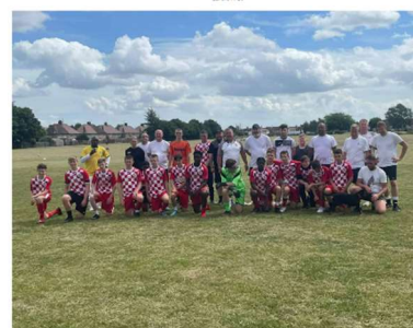
The Fun Walk