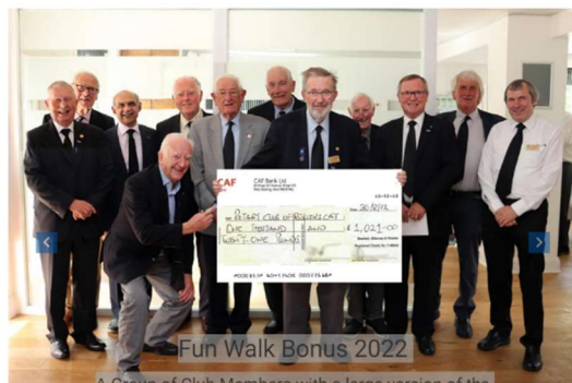
A Group of Club Members with a large version of the Bonus Cheque

Over £1000 bonus from this year's Billericay Platinum Jubilee Fun Walk