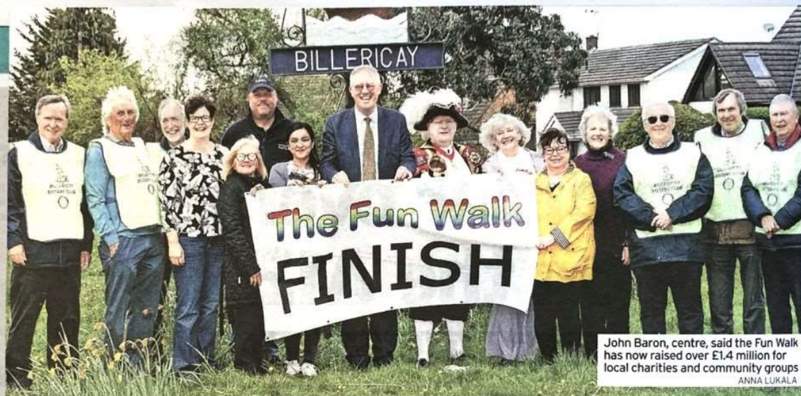
John Baron, centre, said the Fun Walk has now raised over £1.4 million for local charities and community groups

John Baron MP, chair of The Fun Walk Trustees, said: "I am very happy to announce that, with the generous support of our bonus pot sponsors, this year we have been able to provide a 40 per cent bonus over and above the amount raised