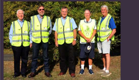
The Rotary Club of Billericay at last year's event.

The sponsored walk, which has been an annual event in Billericay, Essex, since 2002, is a fun challenge for participants which helps charity and community groups generate much-needed funds for their causes.