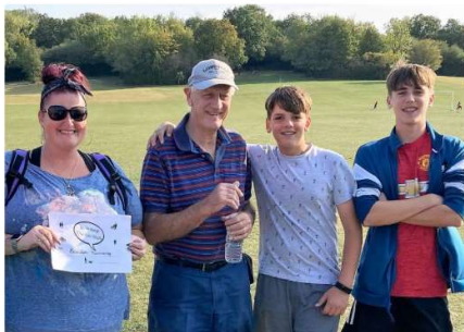
The Basildon Twinning Association at last year's event

The event organisers are hoping to beat last year's total raised of £103,000 and, with the bonus pot getting closer to £25,000, it's looking like it could be another great year.