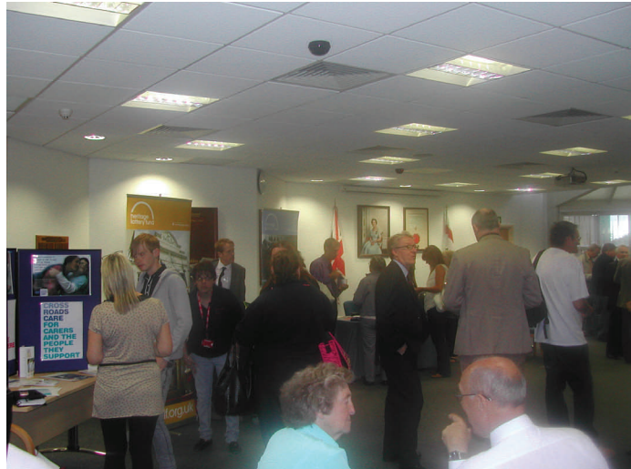
CVS Funding Fayre

Representation on behalf of BBWCVS has been made at various meetings with the Basildon Borough Council in respect of development work throughout the area of Basildon, Billericay and Wickford including satellite areas for example, Pitsea, Laindon, Vange. Much development work was carried out with the BIG LOCAL in Pitsea which was founded by Lottery Money being put into the area.