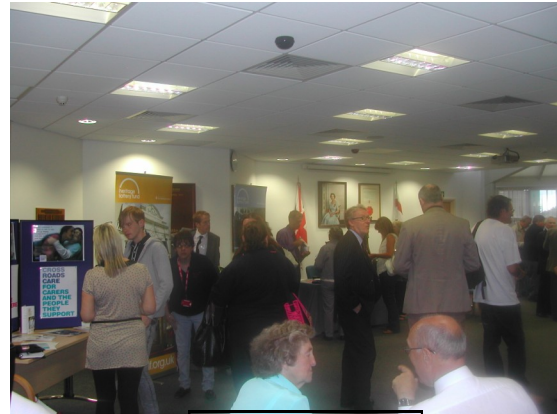
CVS Funding Fayre

A funding fayre was held in June 2011 and funding organisations who attended were kept busy throughout the day as there was an 'open door' policy and the event was attended by 55 different organisations.