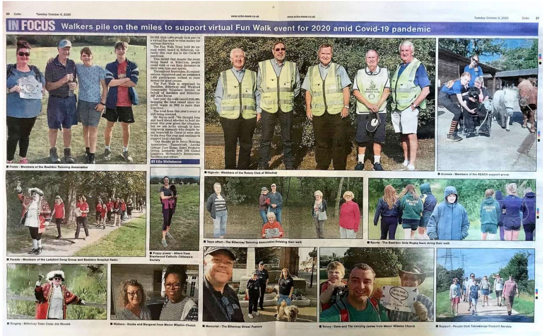
IN FOCUS Walkers pile on the miles to support virtual Fun Walk event for 2020 amid Covid-19 pandemic

We were delighted by the wonderful photos and posts shared by participating organisations.