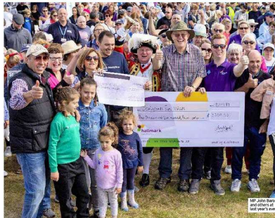
MP John Baron and others at last year's event

"This year's sponsors are Swan Housing Association, Tunnelcraft, IFE Global Logistics, Anisha Grange Care Home, Butyl Products Group, Leonardo MW, McDonald's Restaurants Basildon and others. Once again, these are businesses supporting our local communities."