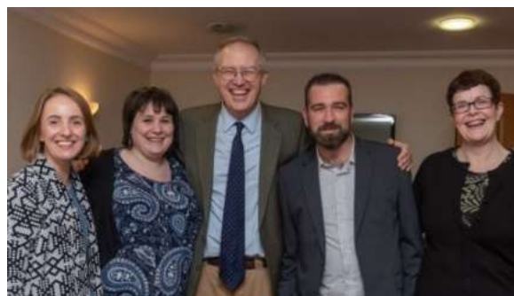
John Baron MP with the BBW CVS Team in 2019