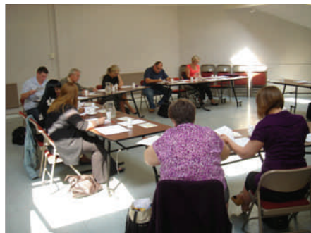
Attendees training on how to write SMART outcomes in Pitsea Leisure Centre.