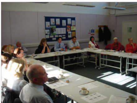
Participants at a Funding Workshop